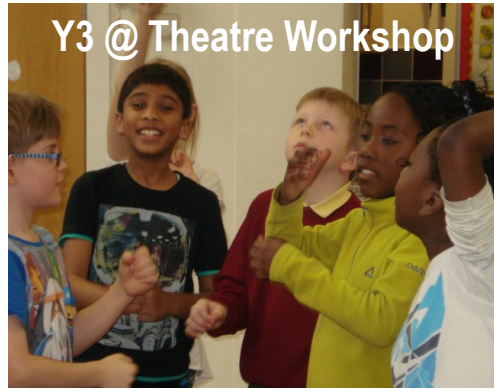
Y3 @ Theatre Workshop