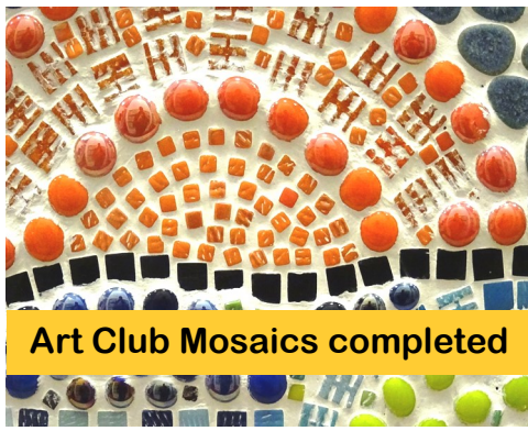
Art Club Mosaics completed

The term has got off to a lively start with Year 6 children visiting Holdenby House on the first Thursday back (they made rose soap, buns, rolls and did the ironing!). Parents of Y6 children will doubtless learn more through Class