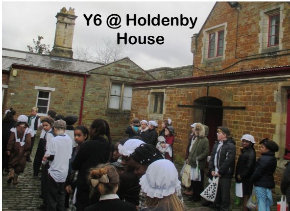
Y6 @ Holdenby House

The term has got off to a lively start with Year 6 children visiting Holdenby House on the first Thursday back (they made rose soap, buns, rolls and did the ironing!). Parents of Y6 children will doubtless learn more through Class